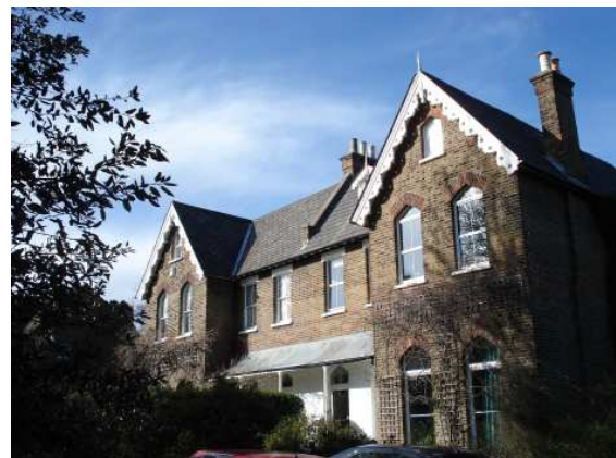
44-46 Snakes Lane West – for the edification of Tory Councillors on the Planning Committee

We question whether those councillors who approved this planning application have any interest whatsoever in local democracy and the opinions of local residents.