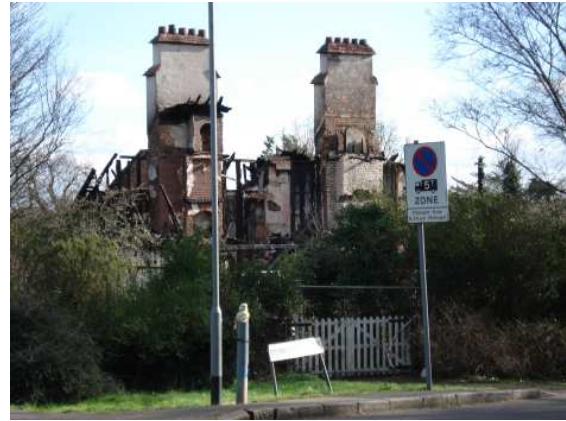
Little Monkhams - or what is now left of it!